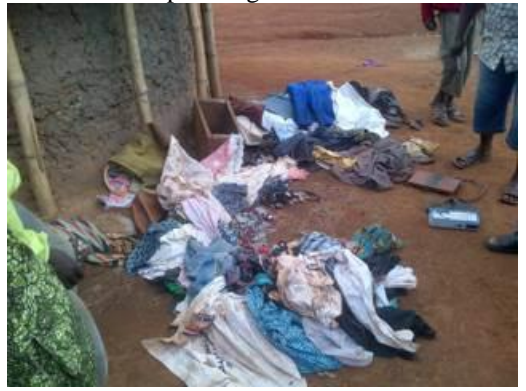
Victims Clothing and Personal Effects

knows better than continue to show interest in the case! Abu Ragbaja who confessed to receiving <u>about</u> <u>10 -15 clients every week</u>, now has enough time to eradicate all implicating evidences.